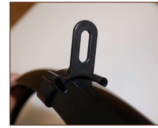
Fig. 7: Rear fender clip

• Labor required to remove and/or refit and re-adjust the product within the bicycle assembly This warranty gives the consumer specific legal rights, and those rights and other rights may vary from state to state. 5585 9/10