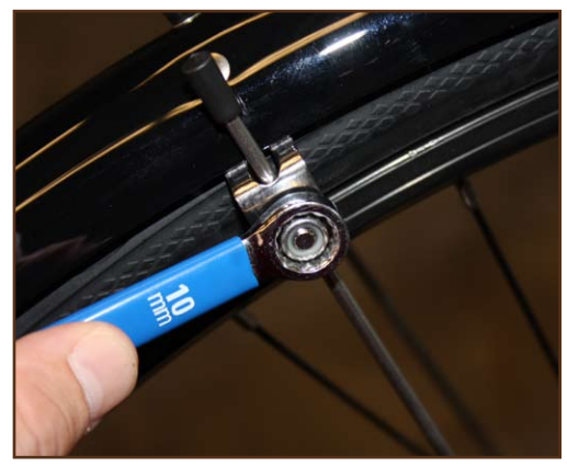
Fig. 12: Rear fender stay adjustment