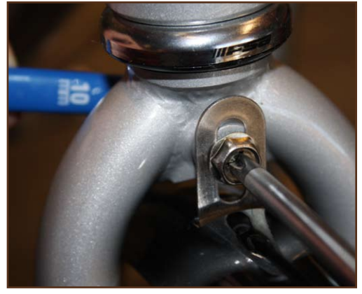
Fig. 2: Front fender L-bracket installation