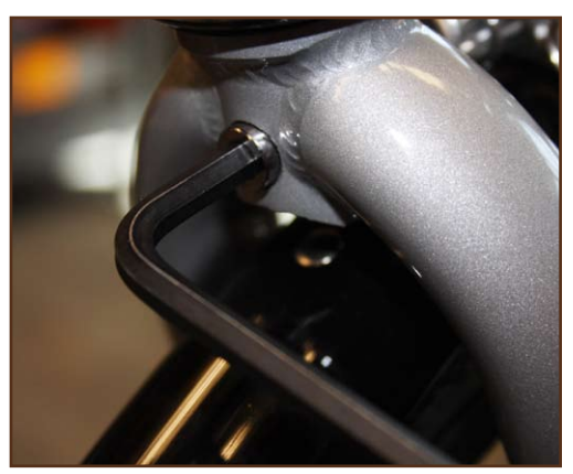
Fig. 4: Front fender L-bracket installation (for road brakes)