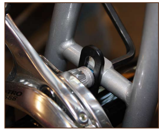
Fig. 9: Rear fender clip installation (for road brakes)