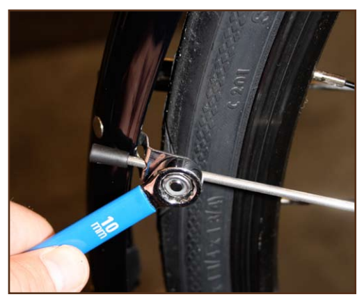
Fig. 6: Fender stay adjustment