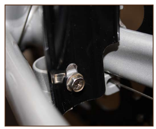
Fig. 10: Rear fender to chainstay bridge attachment