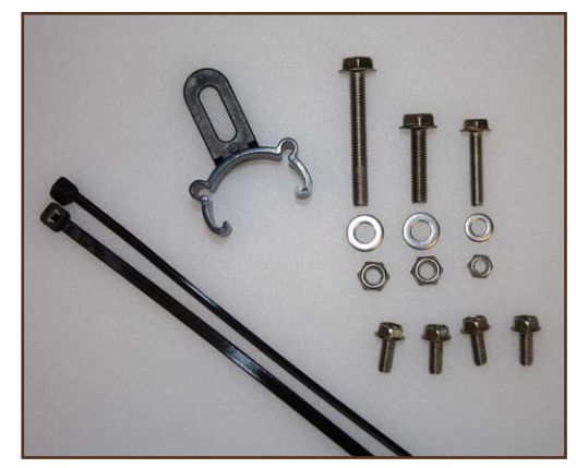
Fig. 1: Installation hardware