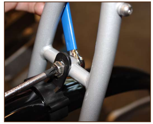
Fig. 8: Rear fender clip installation