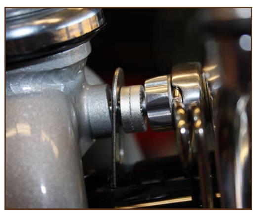
Fig. 3: Front fender L-bracket installation (for road brakes)